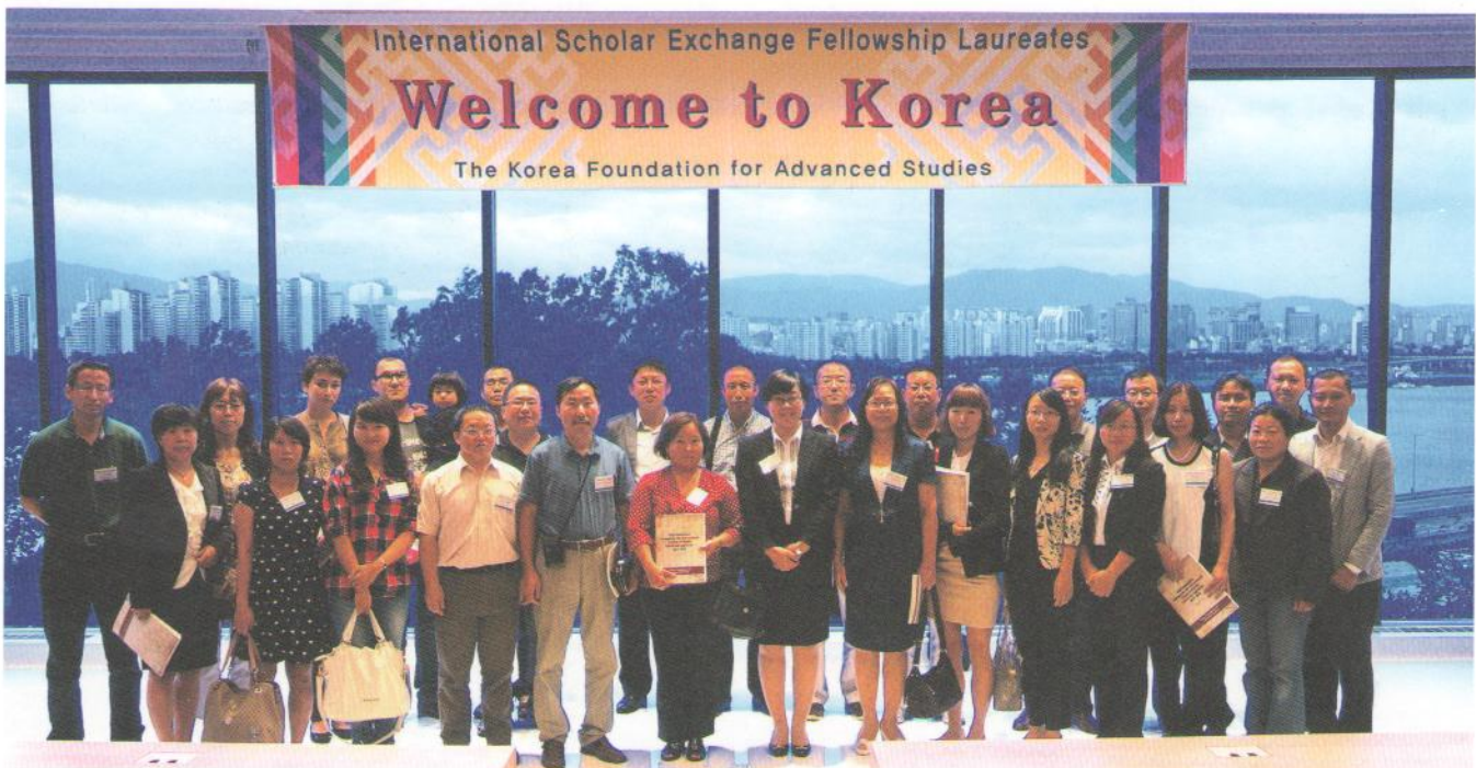
Arrival of the 2012-2013 ISEF Laureates

Recently, the West has shown a growing sense of awareness in traditional Asian culture and ideas through their reflection on Western civilization. As evidenced by such development, Korea Foundation for Advanced Studies believes that, in the 21 st century,